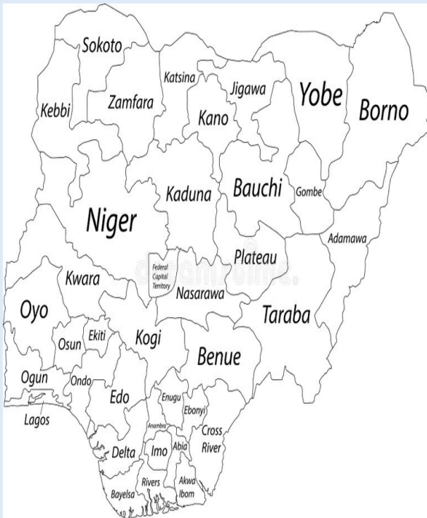
Pic 1.1 : Map of Nigeria